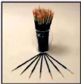
PB High Quality Brushes, available from sizes 000 - 4