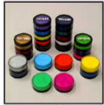
Professional Stackable 3 oz. water based face paint. Available in Essential (PE), Neon (PN) and Metallix (PM) colors