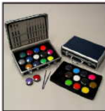
PC 2 26 Professional Makeup Case includes 26 - 2 oz. domed cakes and 12 brushes