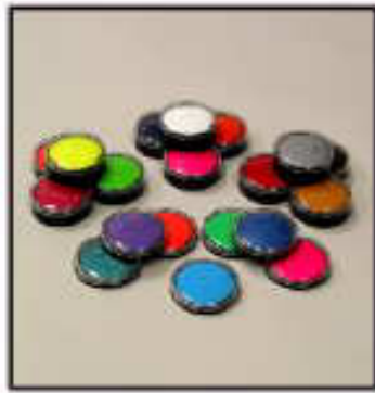
Professional Domed 1 & 2 oz. water based face paint. Available in Essential (PE), Neon (PN) and Metallix (PM) colors