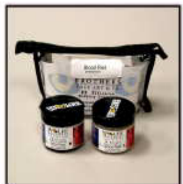
FXSI FX Silicone modeling compound, each set has two 2 oz jars (part A & B) available in ice, blood, clear, violet, light, medium, & dark.