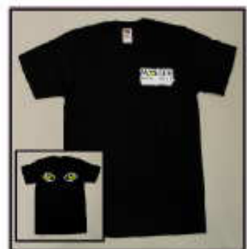
TSH Wear-Wolfe T-Shirts available in SM - XXXLG

424 E Central Blvd. Suite 310, Orlando, 32801