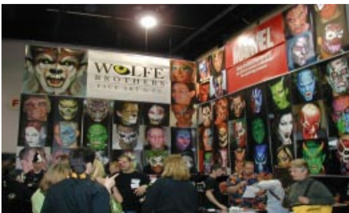
2005 TransWorld National Halloween Show Wolfe Brothers Face Art and FX booth