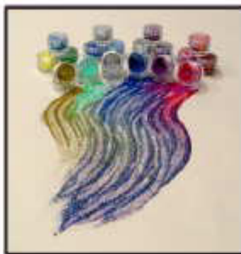
BG2.5 Body Glitter, octagon cut, 17 different colors