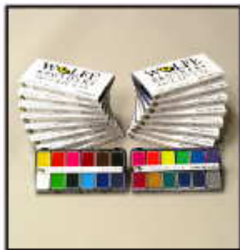
FS Appetizers 12 water based face paints, .02 oz each, available in Essential and Neon/Metallix colors